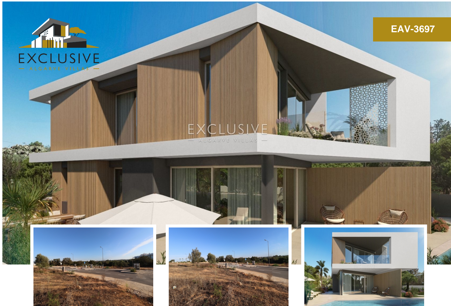
CENTRAL LOCATION, PLOT FOR CONSTRUCTION, FOR SALE ALBUFEIRA, ALGARVE