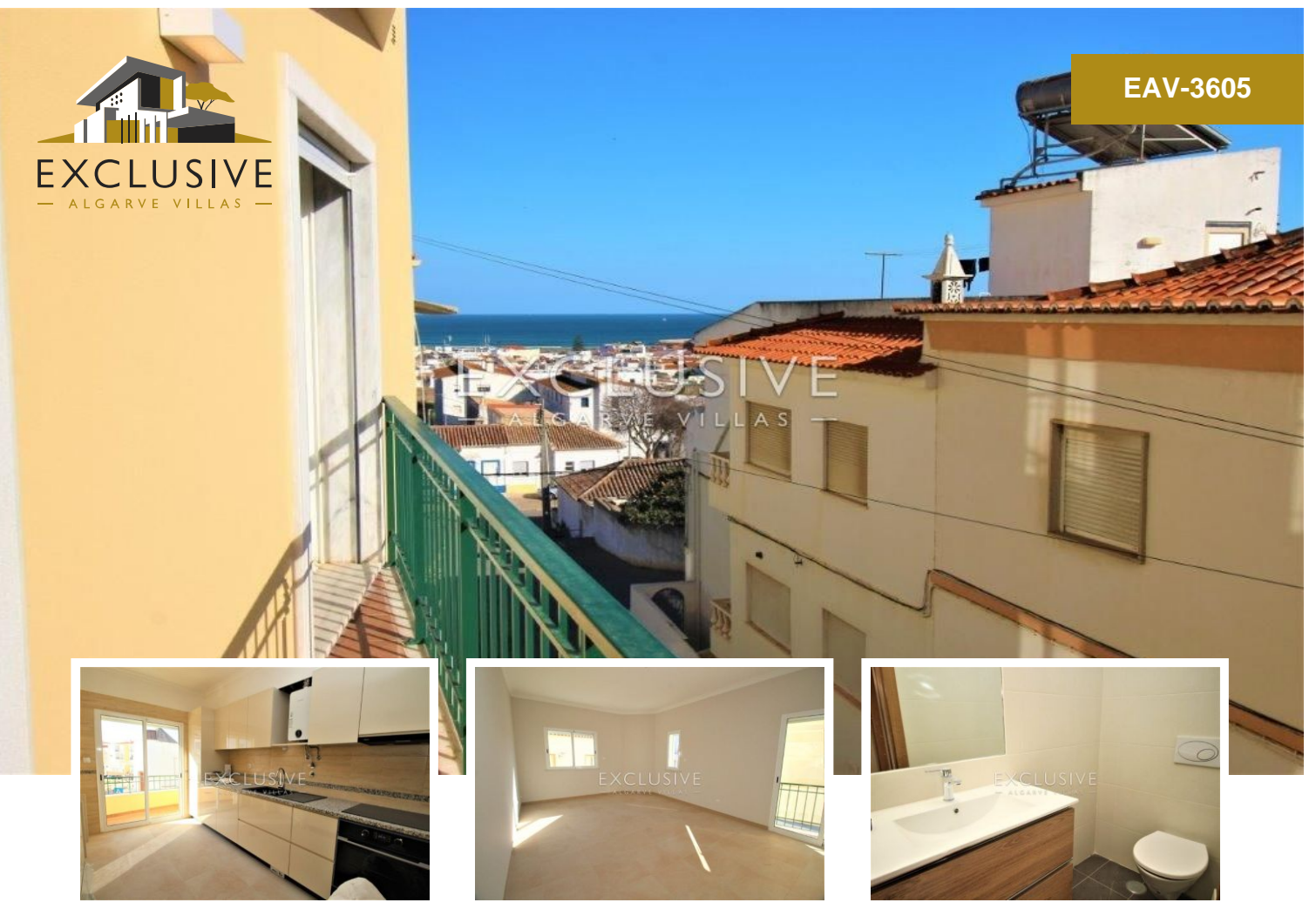
MODERN 2 BEDROOM APARTMENT CLOSE TO THE CITY CENTER, FOR SALE IN LAGOS (ALGARVE)