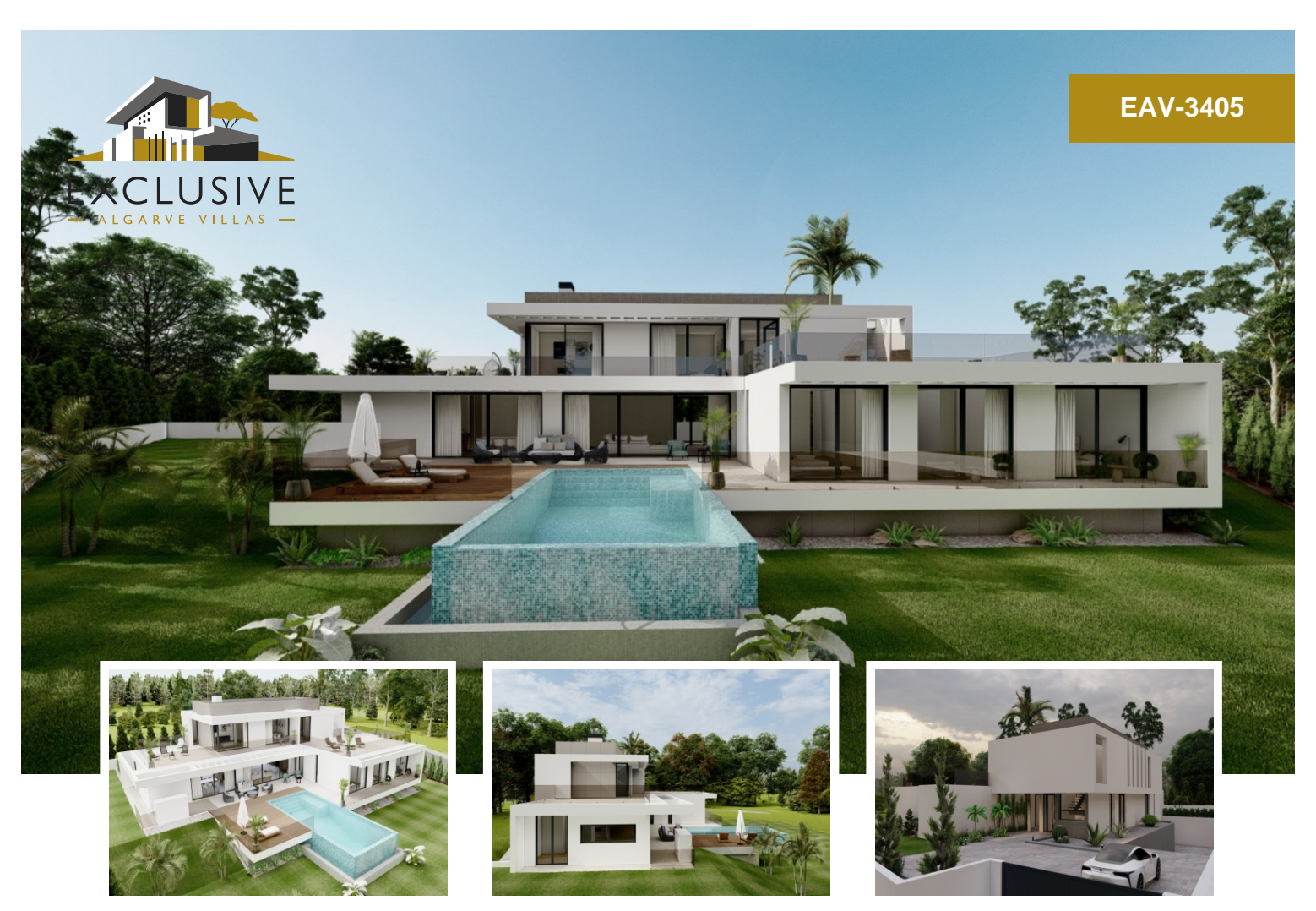
AMAZING CONTEMPORARY VILLA WITH POOL FOR SALE IN CARVOEIRO, ALGARVE